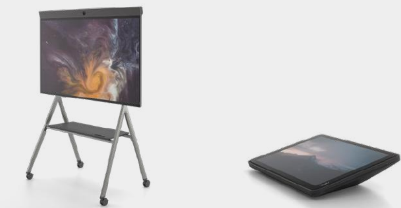
Neat Board (with floor stand)

Creative rooms for brainstorming sessions and group work with in-room and remote participants often means the flexible use of furniture and office layout to adapt to changing activities.