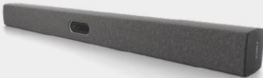
Neat Bar Pro