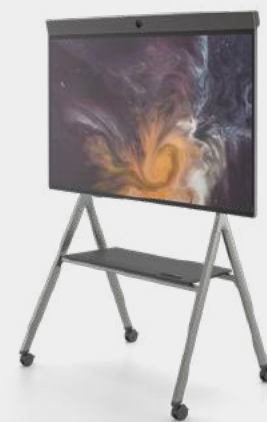
Neat Board (with floor stand)