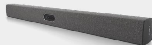
Neat Bar Pro