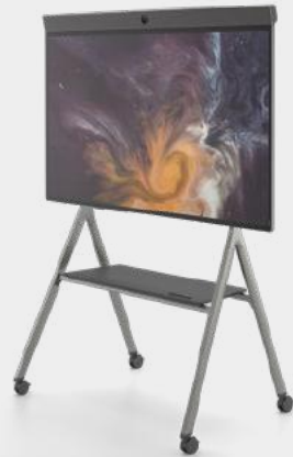
Neat Board (with floor stand)

Open offices provide employees with work and social areas, inspiring spontaneous meetups, collaborative sessions and agile team exercises. They also prompt personal workspaces reservable via hot desking for ad-hoc syncs with remote colleagues at your desk.