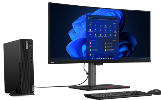
ThinkCentre M90s Gen 4