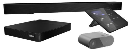
ThinkSmart Core Full Room Kit

With Lenovo ThinkShield, a portfolio of hardware and software solutions to protect your organization, you can keep your customers ahead of a range of security threats so their IT teams can focus on what matters.