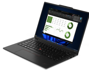
X1 Carbon Gen 11