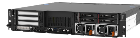
ThinkEdge SE455 V3

As more customers become aware of the benefits, Lenovo TruScale for Edge and AI can help you simplify customer access to powerful solutions through a rapid, scalable service on a pay-as-you-grow model.