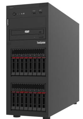
ThinkSystem ST250 V3