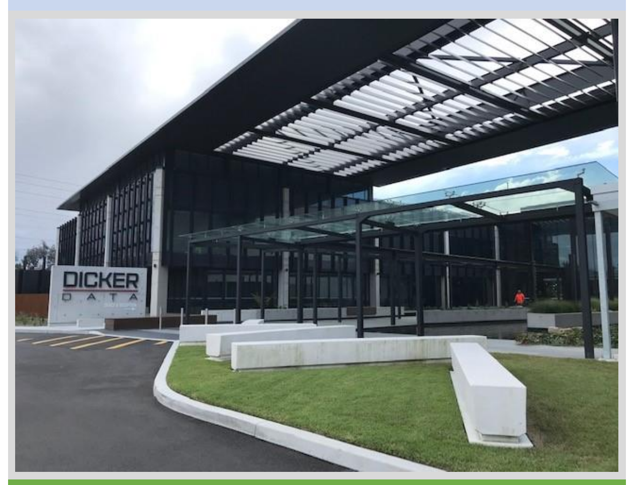
Assessment of Dicker Data Environmental Management System in Compliance against the SSD 8662 Conditions of Consent