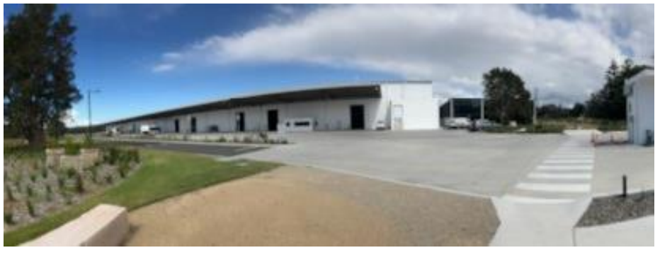
Photo 4 – Panoramic view of warehouse exterior taken from delivery gate

Photo 3 – Panoramic view of warehouse interior