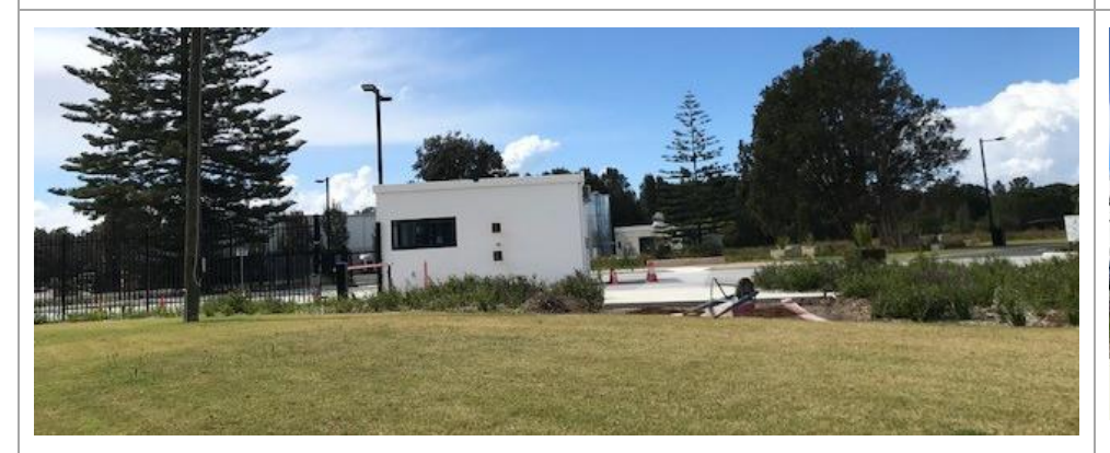
Photo 6 – Delivery entry gate. Water pooling delineated and control measures in place.